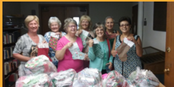
Delivering our 2016 stockings!